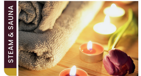
STEAM & SAUNA